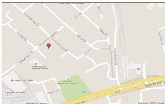
NEWBURY GROUP PRACTICE 40 Perryman's Farm Road, Ilford IG2 7LE