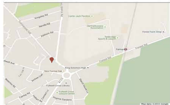
FULLWELL CROSS MEDICAL CENTRE 1 Tomswood Hill, Ilford, Essex IG6 2HG

Please do not call these surgeries to book in. Please use 020 3770 1888 to book an appointment. Thank you.